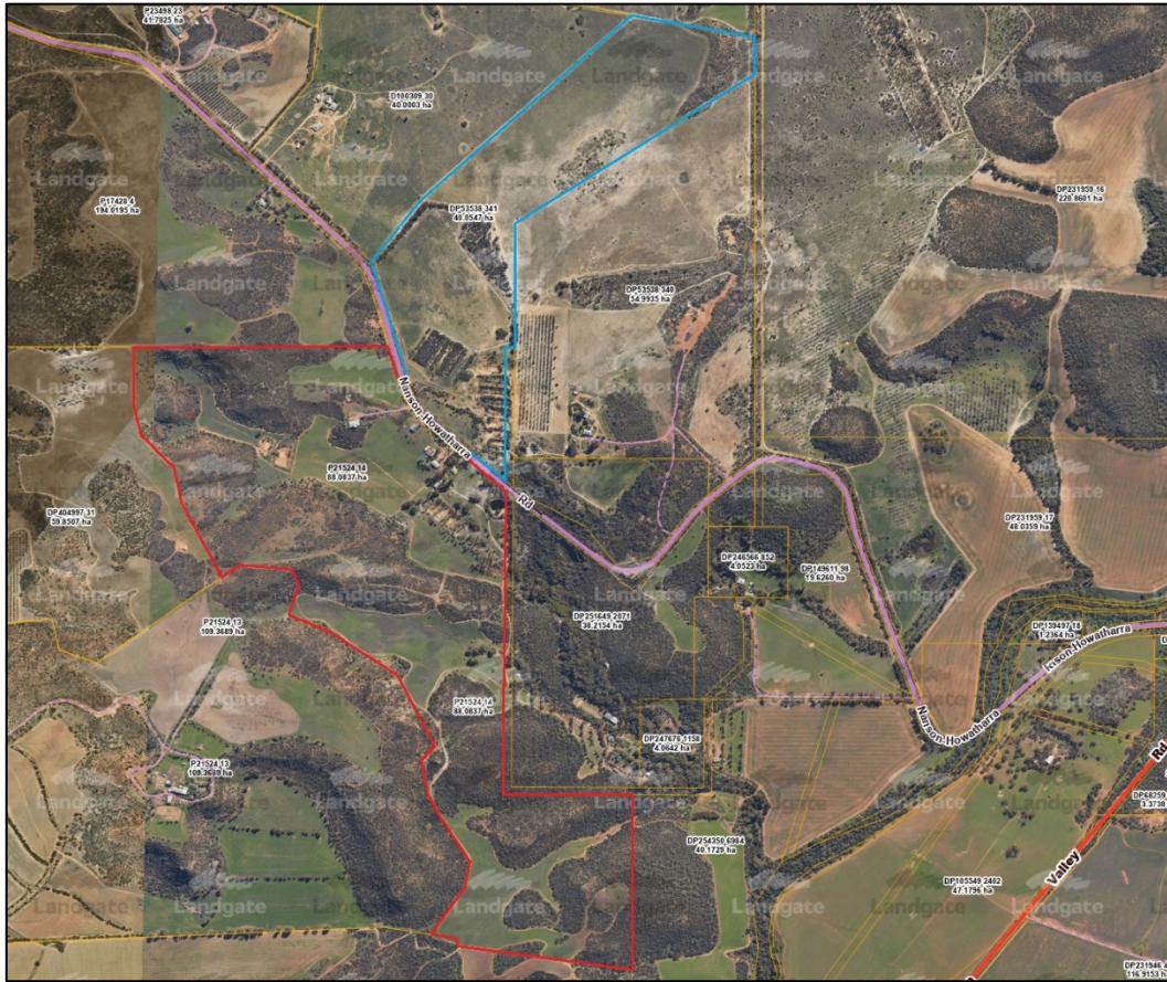
Figure 10.1.1.2 – Aerial photo of developed areas upon Lot 14 & Lot 341 Nanson-Howatharra Road, Nanson