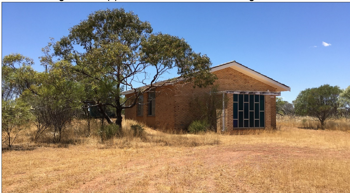
Figure 10.1.1(c) – View of Yuna Church looking south-east