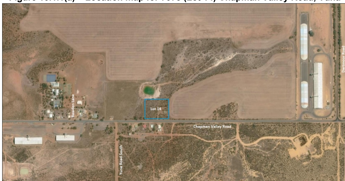
Figure 10.1.1(b) – Aerial Photograph of 7073 (Lot 14) Chapman Valley Road, Yuna