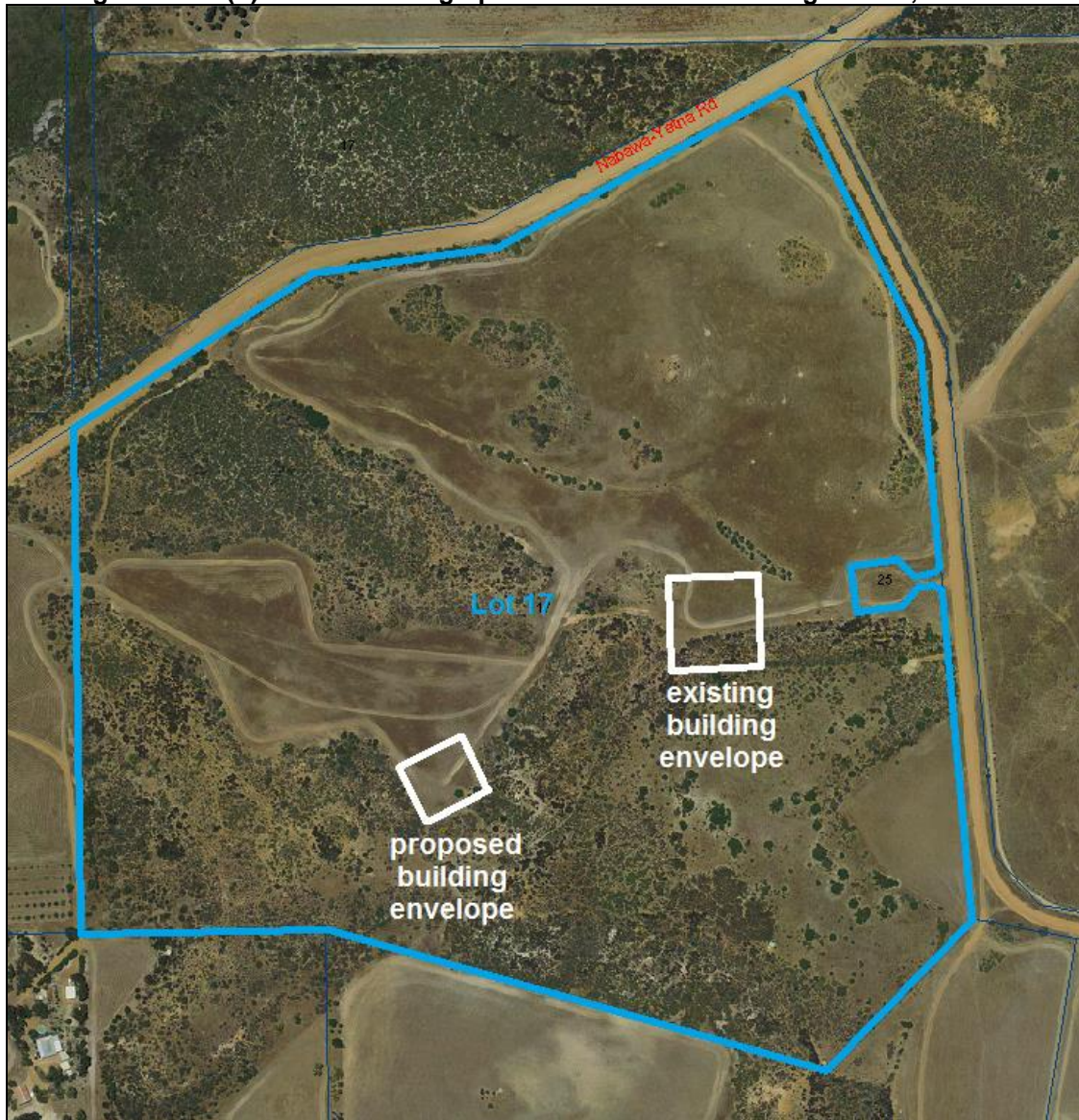
Figure 10.1.1(b) – Aerial Photograph of Lot 17 James Eastough Close, Nanson

Shire staff raise no objection to the relocation of the building envelope on the following basis: