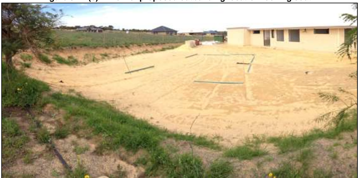
Figure 9.1.1(c) – View of proposed outbuilding location looking south