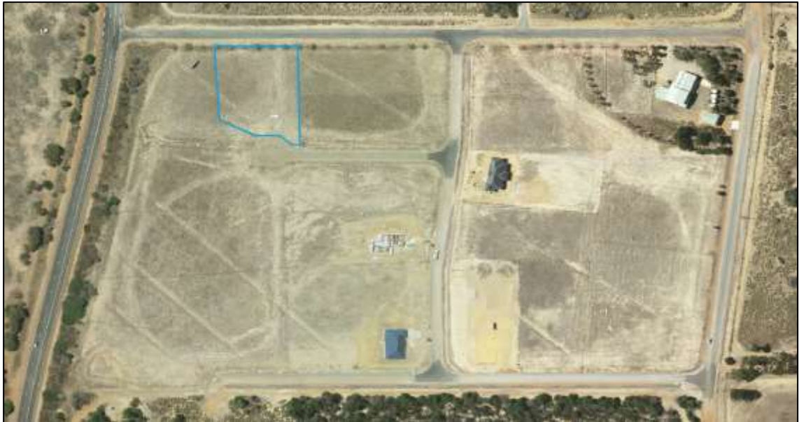
Figure 9.1.1(b) – Aerial Photograph of 6 (Lot 125) Heights View, Buller

The outbuilding is proposed to be located 5m from the secondary street (Wokarena Road) boundary and 5m from the side (eastern) property boundary, and as this is closer than the 7.5m listed under the Residential Design Codes of Western Australia ('R-Codes') for this zoning the application exceeds the delegated authority of Shire staff and is presented to Council for its deliberation.