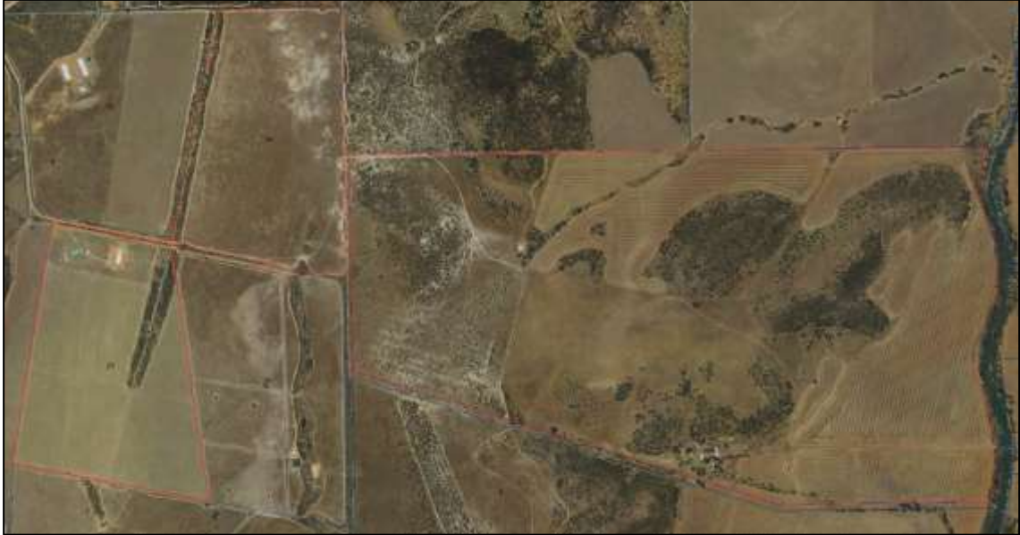
Figure 9.1.2(b) – Aerial Photograph of Lots 19 & 21 James Eastough Close & Lot 15 Chapman Valley Road, Nanson

The applicant has provided the following information in support of their proposal: