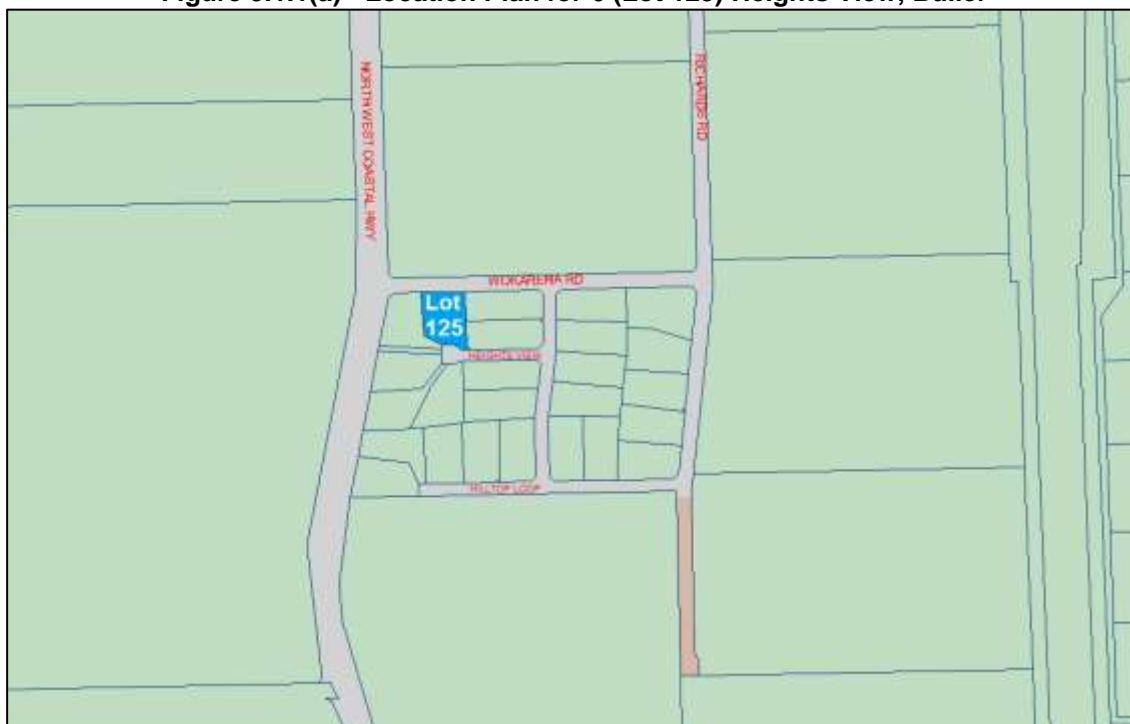
Figure 9.1.1(a) - Location Plan for 6 (Lot 125) Heights View, Buller

The construction of the residence upon Lot 125 is nearing completion and the landowner is seeking to locate an outbuilding behind the residence in the north-east corner of the property.